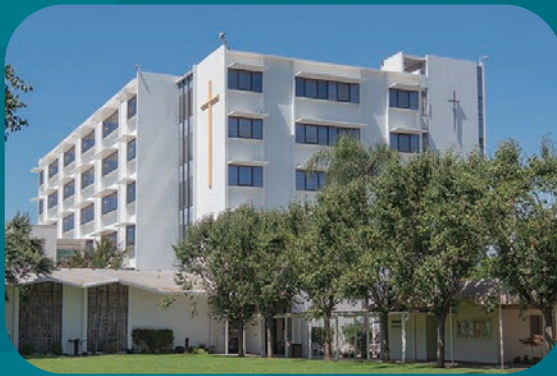
Queen of the Valley Hospital