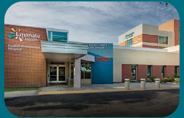
Foothill Presbyterian Hospital

Emanate Health provides award-winning care to the one million residents of the San Gabriel Valley in California. Our nationally-recognized teams and top-rated doctors provide specialized care in areas such as behavioral health, cancer, cardiovascular, neuroscience and stroke, orthopedics, sports medicine and women's health. The health care system has been voted "Best Hospital" and "Favorite Hospital" for multiple years by the community as well as "Best Place to Work". Our providers are consistently among the "Top Doctors" in Los Angeles County, and our services have received awards and recognitions throughout the years.