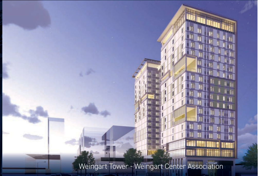
Weingart Tower - Weingart Center Association