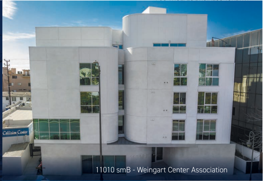
11010 smB - Weingart Center Association