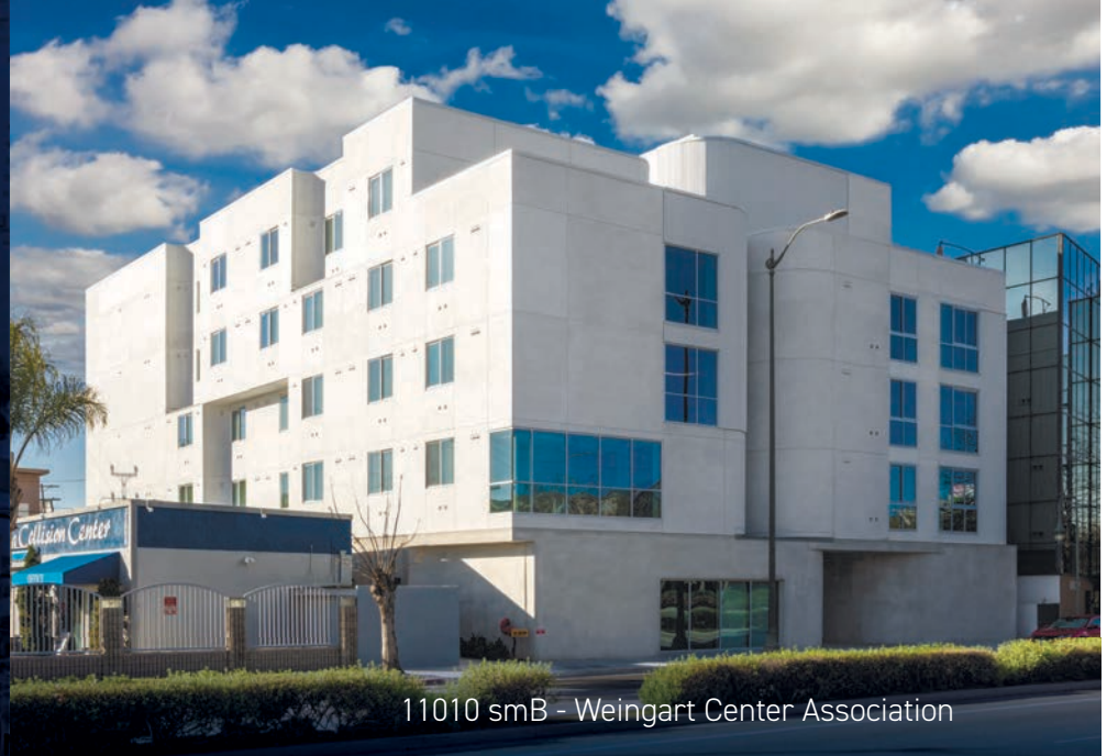
11010 smB - Weingart Center Association