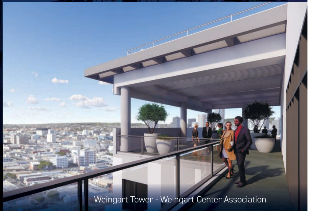
Weingart Tower - Weingart Center Association