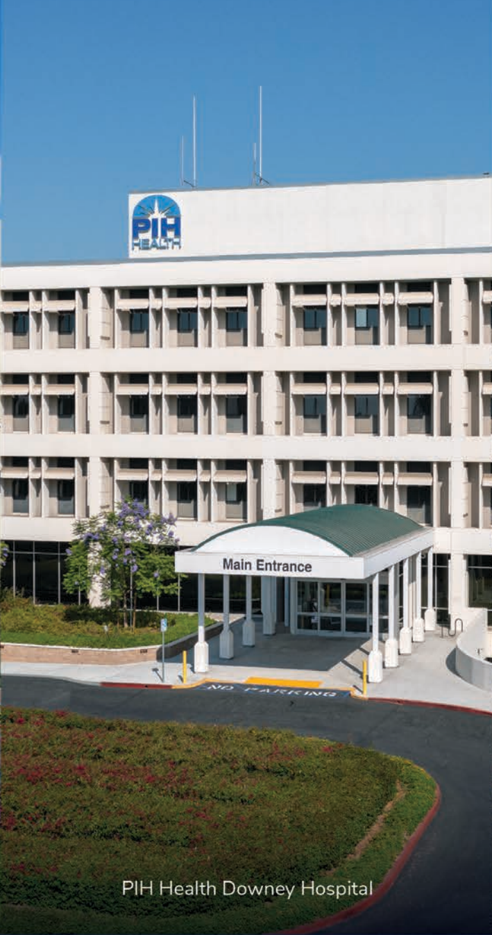
PIH Health Downey Hospital