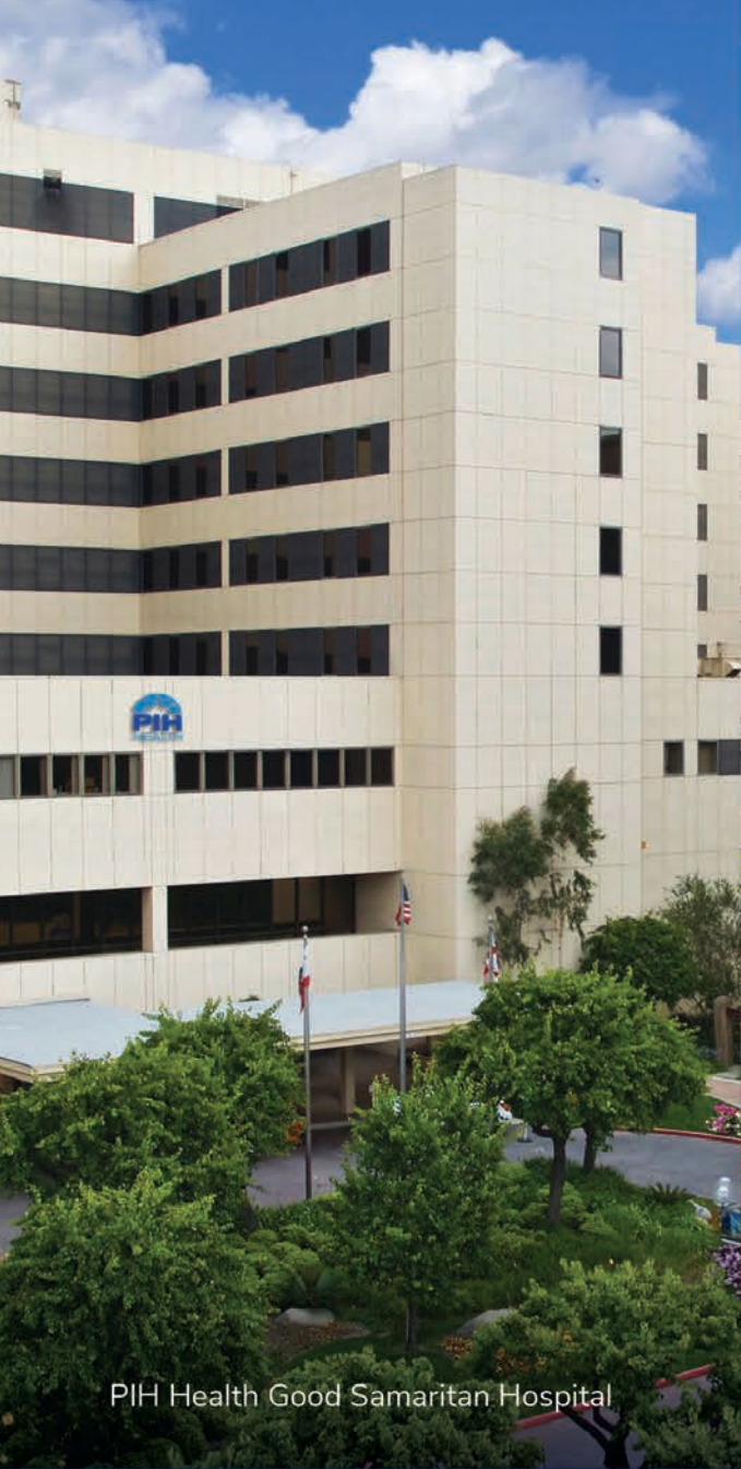
PIH Health Good Samaritan Hospital