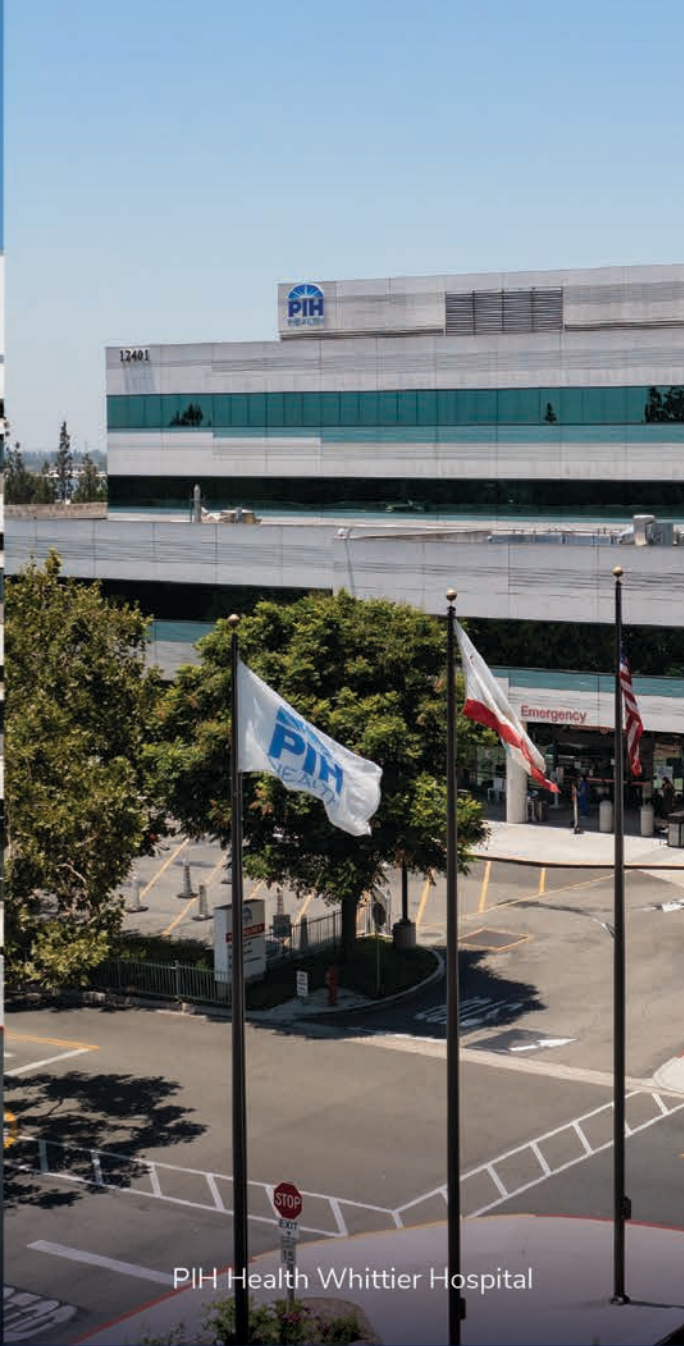
PIH Health Whittier Hospital